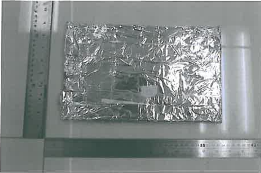
Photo 1. Tested sample – UNIDECO-Recycled (Product item No.: KW 5012) –