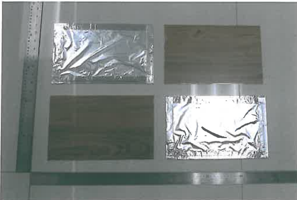
Photo 2. Test specimen – UNIDECO-Recycled (Product item No.: KW 5012) –