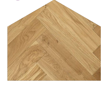
French Natural Herringbone

Dimension: 888 x 148 x 14/3mm Profile: Tongue & Groove Installation: Glue down