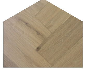
French Ghost Herringbone