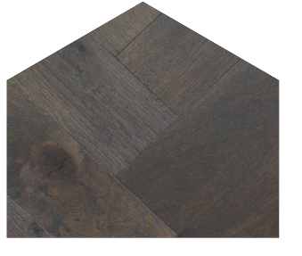
French Carbon Herringbone