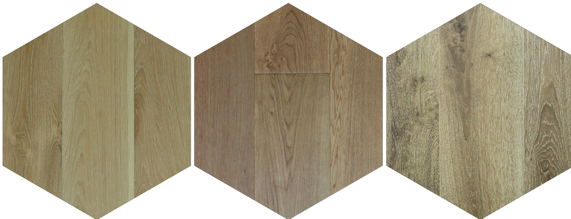
Limed Piccolo Oak