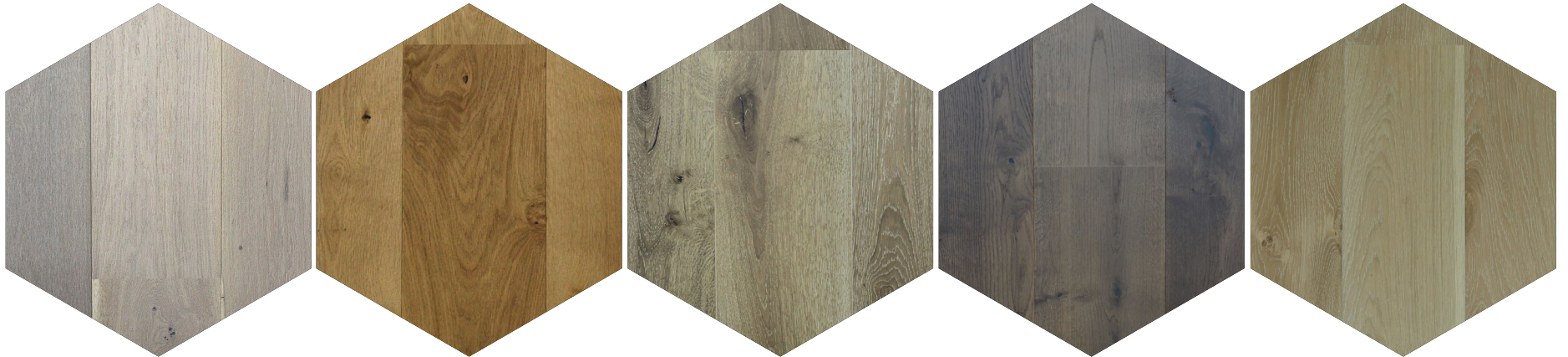
Elegant White Oak