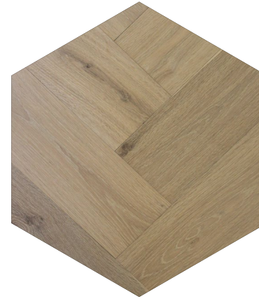
French Ghost Herringbone