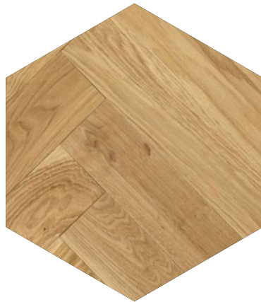
French Natural Herringbone