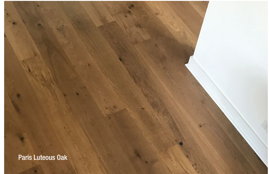
Paris Luteous Oak