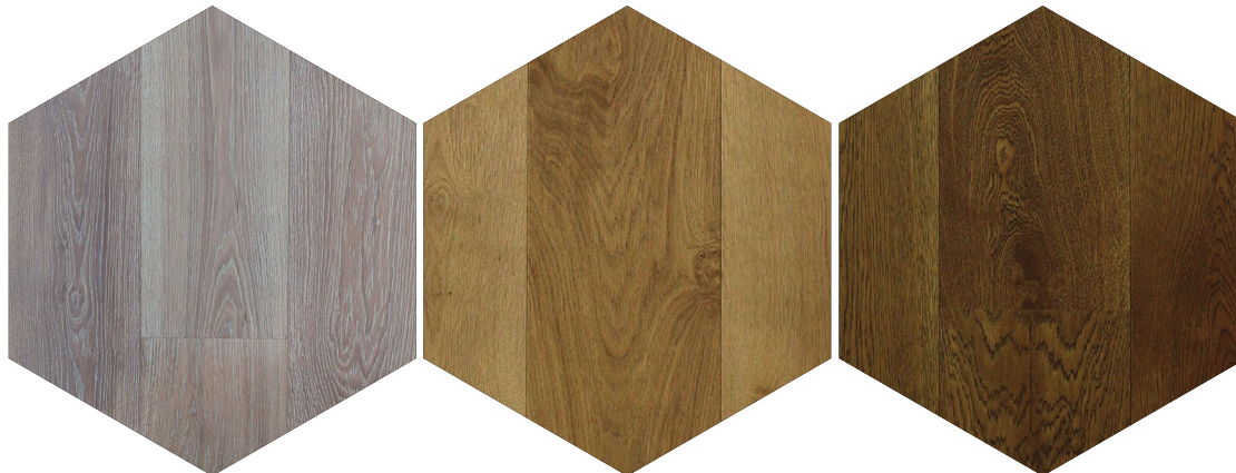
Elegant Milano Oak