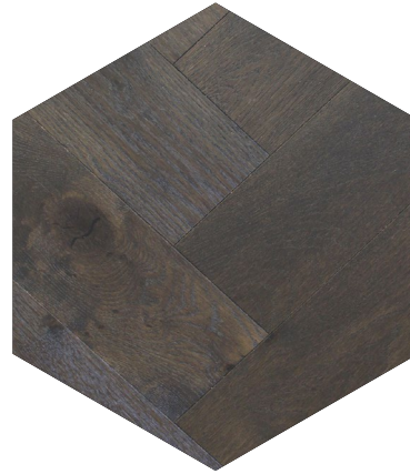
French Carbon Herringbone