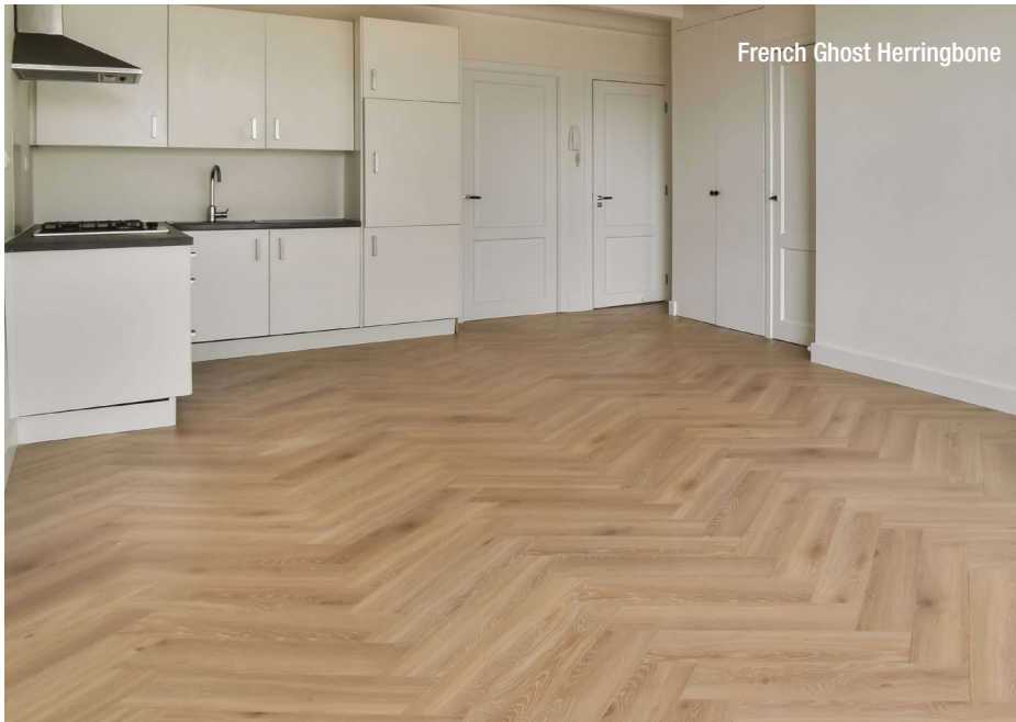
French Ghost Herringbone