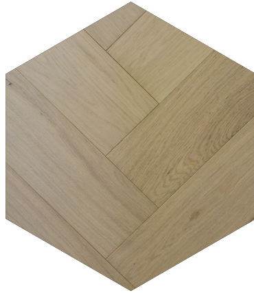
Danish White Herringbone