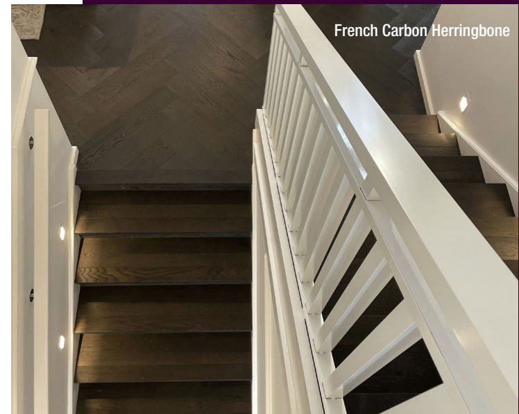
French Carbon Herringbone