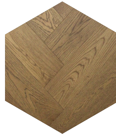
Fiona Brown Herringbone

Swish Oak Flooring is a beautifully crafted range of timeless French Oak. The signature palette of colours, natural grain characteristics, and finishes have been prudently designed capturing timeless elegance, the essence of Oak flooring.