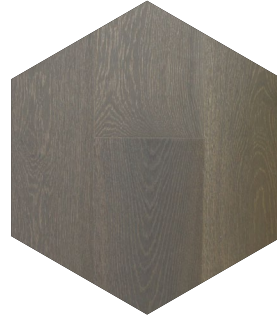
Oak Grey Harmony