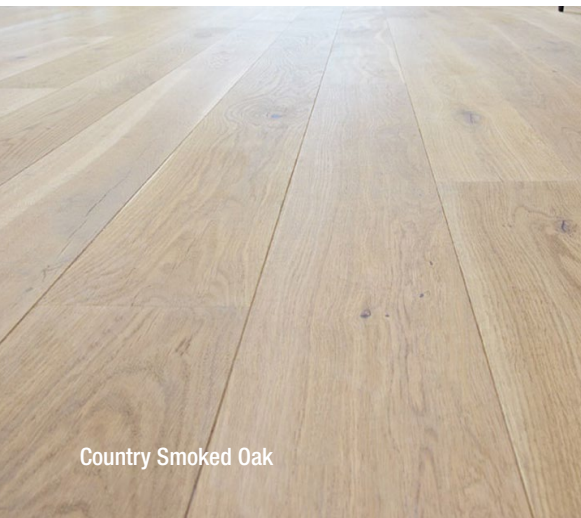
Country Smoked Oak