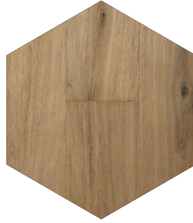
Oak Dove Grey