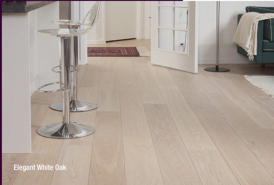
Elegant White Oak