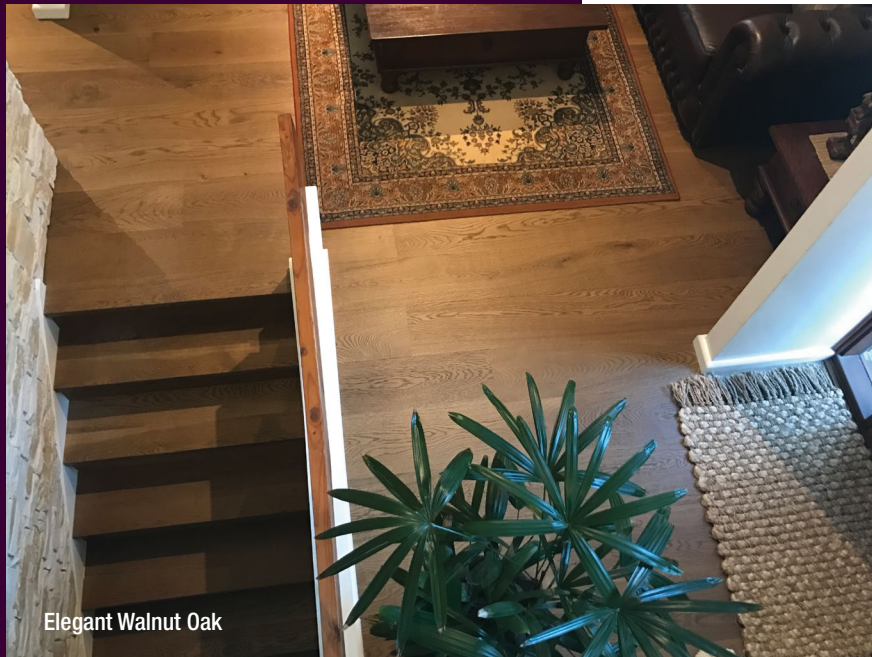
Elegant Walnut Oak