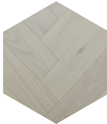
Ambient Sand Herringbone