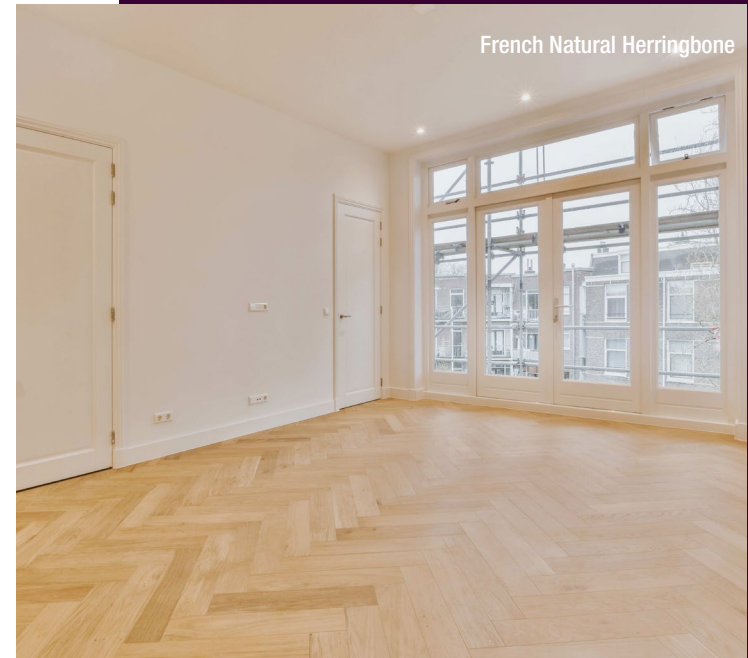
French Natural Herringbone